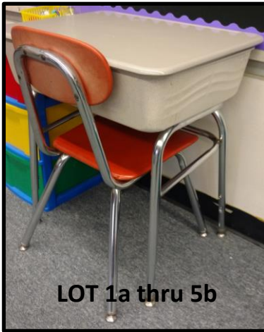
LOT 1a thru 5b