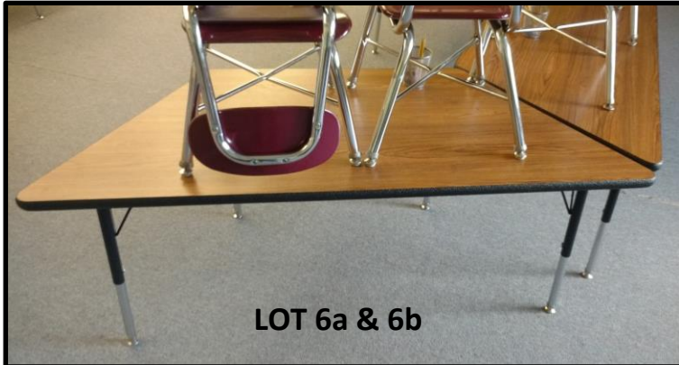
LOT 6a & 6b